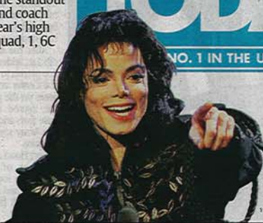
Michael Jackson 1994