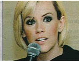
Jenny McCarthy: Focuses on autism.