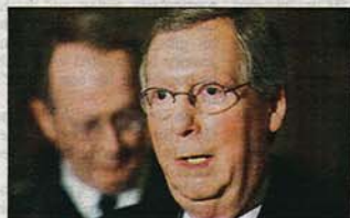
Opposed: Minority Leader Mitch McConnell.